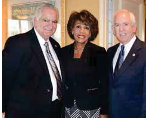
U.S. Congresswoman Maxine Waters, who gave the installation speech and administered the oath of office to the incoming SBACC board, is flanked by City of Torrance Mayor Frank Scotto and Councilman Tom Brewer.